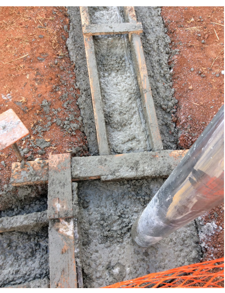
Concrete pour for temporary security fence grade beams underway.