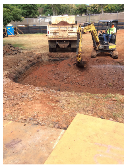
Excavation underway near main entrance for new sediment basin.