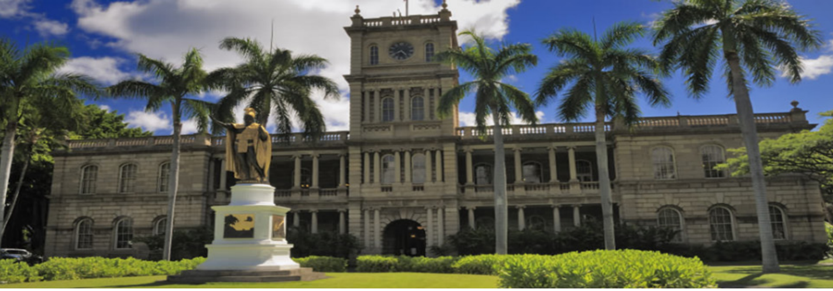
Aliiolani Hale, Seat of the Supreme Court of the State of Hawaii.