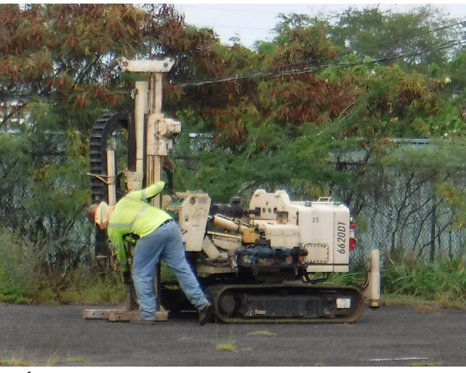
OCCC Team members gathering soil samples from new AQS site for laboratory testing.