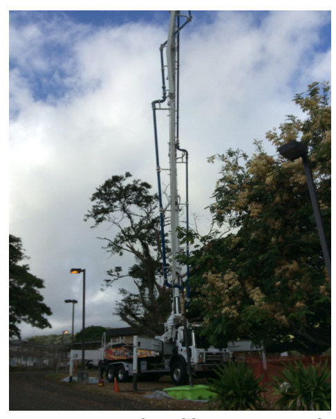
Concrete pump truck used for concrete pour of security fence grade beams.