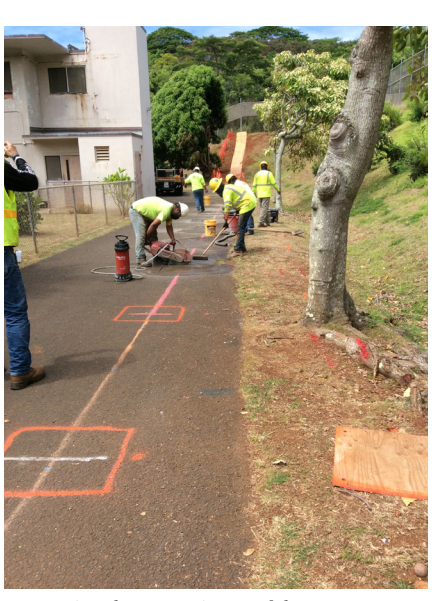
Preparing for augering and fence post installation through the existing access road.