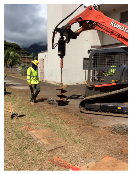
View of augering through existing asphalt pavement for temporary security fence installation