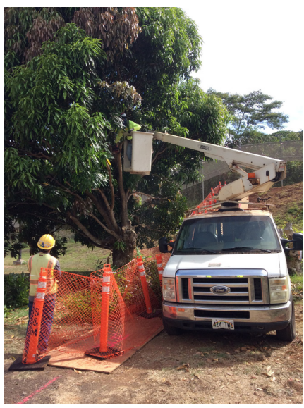
Tree pruning process commenced near Kaala Cottage to meet clearance for the temporary security chain-link fence.

The Women's Community Correctional Center (WCCC) in Kailua is Hawaii's only facility specifically serving the needs of pre-trial and sentenced female offenders and following the ground-breaking held on July 12, 2021, construction has been steadily progressing on much needed improvements. The improvements include a new 176-bed housing unit, a new administration building, a new visitation/intake building, along with upgrades to employee and visitor parking and the access drive to/from Kalaniana'ole Highway. Once completed, the new housing unit and other improvements will allow female pre-trial detainees housed at OCCC to relocate to WCCC. Relocating females detainees to WCCC will improve living conditions, expand treatment and rehabilitation services, and increase opportunities for family visitation. While construction is expected to take approximately two years, steady progress is being made as evidenced by the photographs below. Look for additional construction updates in future newsletters.