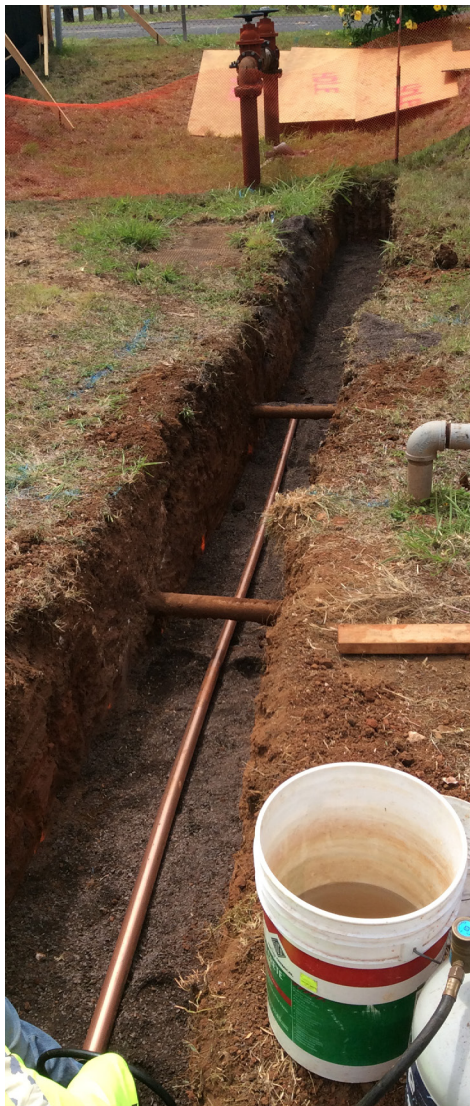
Two-inch copper pipe installed for temporary water line for administration trailers.