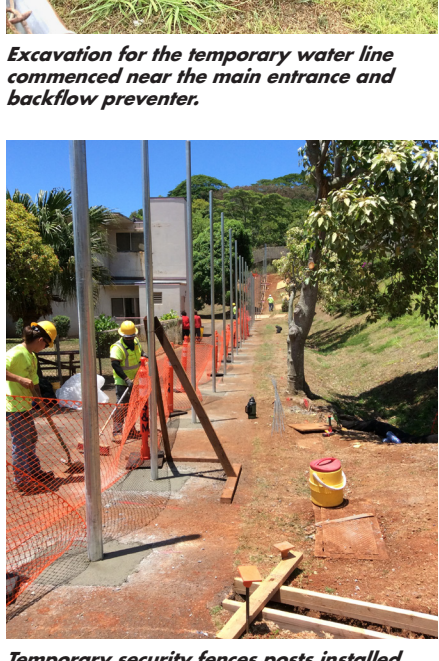
Temporary security fences posts installed.