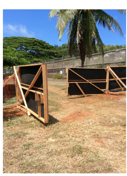
Gates installed for temporary dust fence for heavy equipment access.