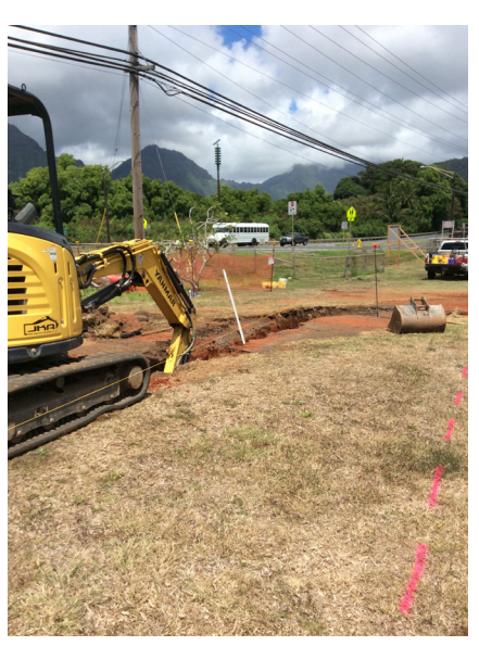
Excavation underway for temporary sewer line. Once installed, sewer line is then backfilled and compacted using a rolling compactor.