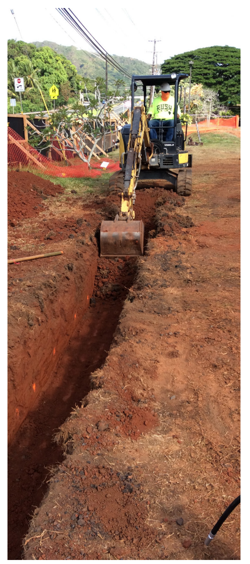
Excavation for temporary water line install near Kalanianaole Highway.