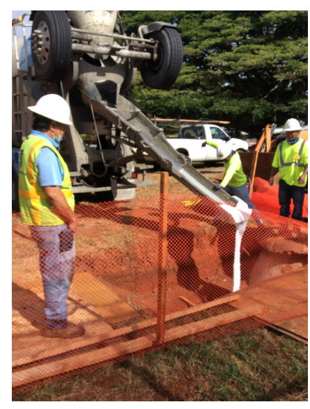
Concrete pour for temporary sewer line connection to manhole