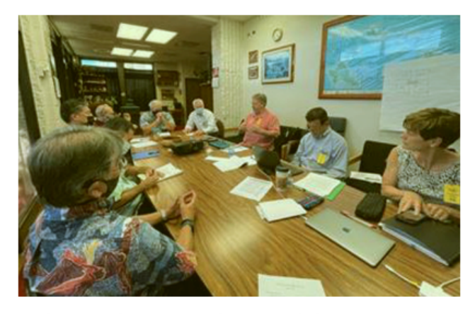
The OCCC Planning Team does not include any community stakeholders or representatives. (DPS photo).

Associates, one of the country's leading justice architectural firms, likewise stress the need for a collaborative approach to jail planning: "Successful jurisdictions use a collaborative approach to planning that include representation of all actors in the criminal justice system and the community including advocates, judges, administrators, legislators, prosecutors, the defense bar, correctional officers, program operators, and community members. The "buy in" from key stake holders is absolutely essential .<sup>23</sup>