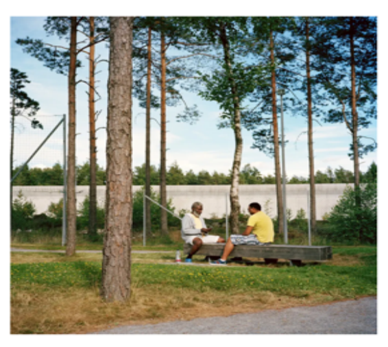
Open space, Halden Prison

The jail should have a courtroom for hearings and bench trials. That would reduce transportation costs, the security risks associated with prisoner transportation, and would expedite case processing and reduce length of stay in the jail.