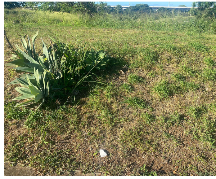
Existing succulent plants, may be added to to frame sidewalk area.