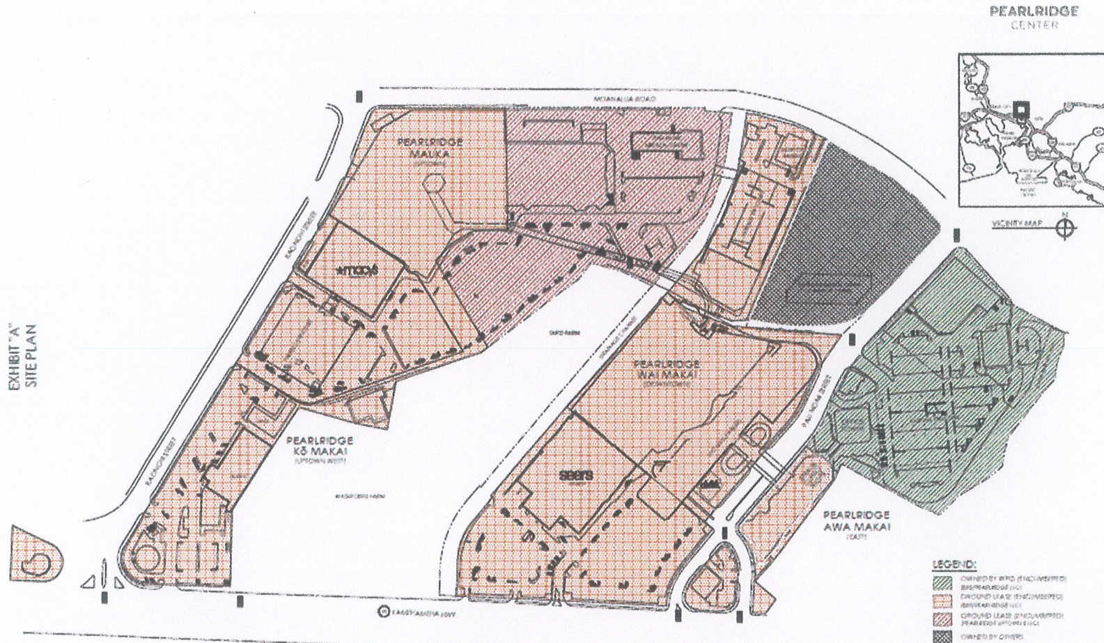
EXHIBIT "A" SITE PLAN