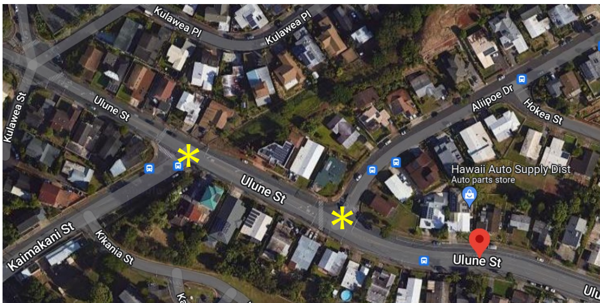
Synchronization of Traffic Lights at Kaimakani/Ulune St. and Aliipoe/Ulune St.

At the last Aiea Neighborhood Board meeting, we received a request for the synchronization of traffic lights on Ulune Street and another request for the striping of Ulune Street.