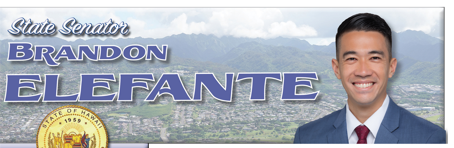
Representing Senate District 16 - 'Aiea, Hālawa, and Pearl City