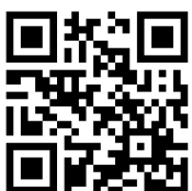
MEETING QR CODE