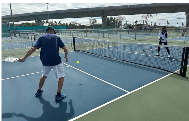
Photo by the Department of Parks and Recreation of Pickleball Players at the Ke'ehi Lagoon Pickleball Complex

As of April 1, 2024, the project to separate the courts at Ke'ehi Lagoon Pickleball Complex to allow for more pickleball courts has been completed. The Pickleball Complex has reopened and is now available for use. Happy Pickleballing!