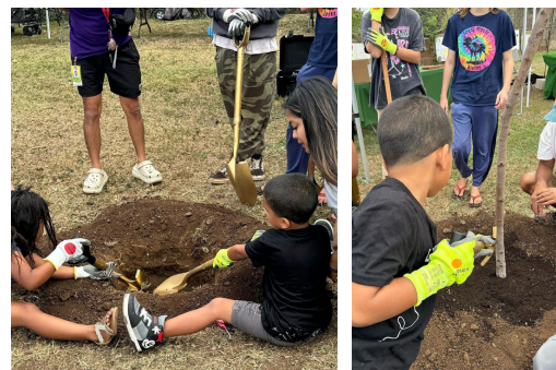
Planting of the four Milo trees at Makalapa Neighborhood Park.