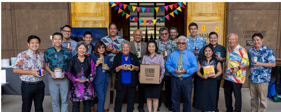
FOOD DRIVE 2024!