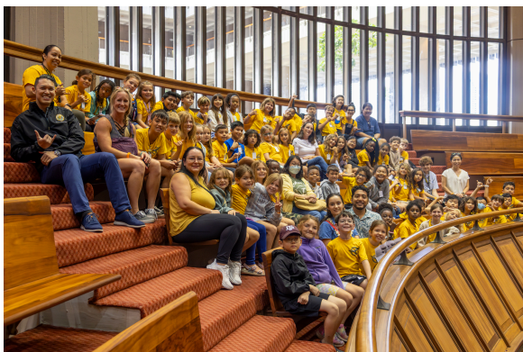
FORT SHAFTER ELEMENTARY VISITS THE CAPITOL!