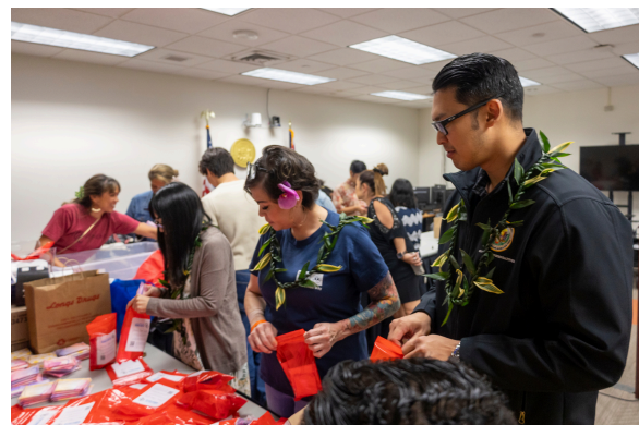
MA'I MOVEMENT 2024