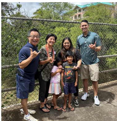
SALT LAKE WATERWAY & LIKINI STREET MINI-PARK COMMUNITY GENKI BALL CLEAN-UP: