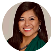
Honolulu City Councilmember Radiant Cordero