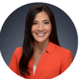
Honolulu City Councilmember Val Aquino Okimoto