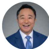
Senator Glenn Wakai