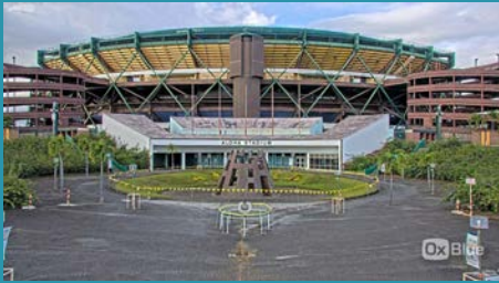
February 27, 2026