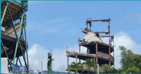
March 9, 2026