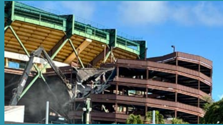
March 4, 2026